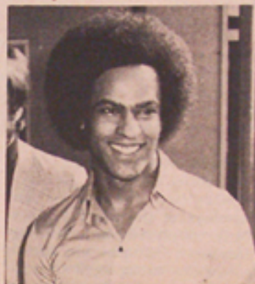
Brother HUEY P. NEWTON.

"3. Why, in July of 1974, did undercover agents again attempt to provoke a confrontation with Huey P. Newton at the Fox restaurant? Why, when Mr. Newton refused the provocation and went to the manager's office, did agents from the Oakland police and the Alcohol, Firearm and Tobacco office of the Treasury Department smash into the office, pistolwhip Mr. Newton and other Panthers while their hands were cuffed behind their backs?