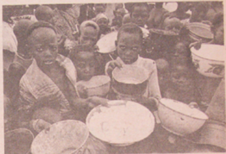
Although the U.S. has become rich from the economic plunder of Africa, it (U.S.) has failed to send needed food to starving children in drought-stricken Sahel.