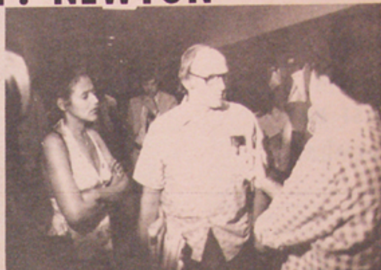
Sister ELAINE BROWN, leading spokesperson for the Black Panther Party, and DAVE DELLINGER, former Chicago 7 defendant, at Alameda County Courthouse last Friday.

"The Committee for Justice for Huey P. Newton is an independent citizens group that today announces its intention to press for a complete investigation into the escalating campaign of harassment, 'dirty tricks,' and character assassination by the Oakland Police Department, in conjunction with federal authori-