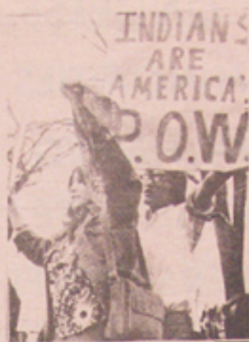
American Indians are justified in refusing to obey U.S. laws.