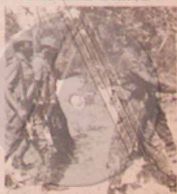
SWAPO guerrillas on military maneuvers.

(We wish to thank Liberation News Service for the information contained in this article.) □