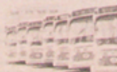
A.C. Transit Strike See Page 7.