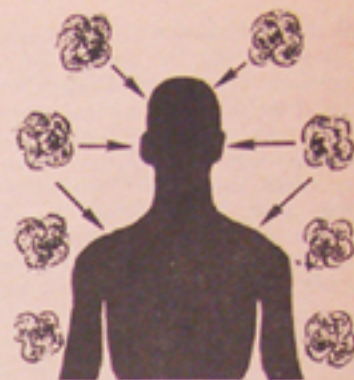
Biological warfare equals racial genocide.

(Detroit, Michigan) - The country's three largest auto manufacturers (Ford, General Motors and Chrysler) have announced that prices for their 1975 models will go up an average of $500. The 1974 models' costs were approximately $500 over 1973 prices. It is also reported by the Chrysler Corporation that prices will increase as the year progresses. □