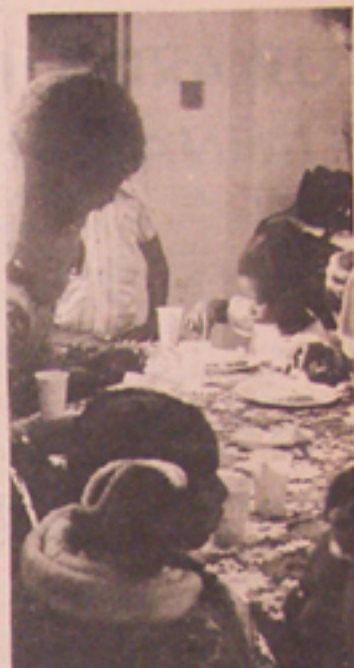
Contributions of Black businessmen made B.P.P. Breakfast Program possible.

Therefore, as revolutionaries we must recognize the difference between what the people can do and what they will do. They can do anything they desire to do, but they will only take those actions which are consistent with their level of consciousness and their understanding of the situation. When we raise their conscious-