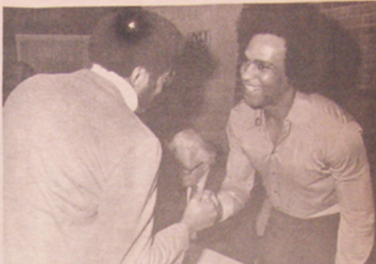
Brother HUEY P. NEWTON, leader and chief theoretician of the Black Panther Party, greets guest at book party held in his honor last February at the Community Learning Center.

Asked what effect these latest developments will have on the work of the Black Panther Party, Ms. Elaine Brown, the Party's leading spokesperson, and candi-