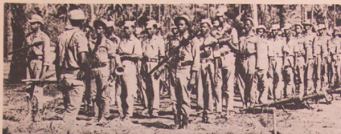
Guinea-Bissau liberation army troops, shown above, have successfully driven Portugal from their country after 500 years of colonial rule. In being one with the people PAIGC has won smashing military victories.