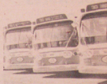
The AC management is the reason why Oakland buses are inoperative.