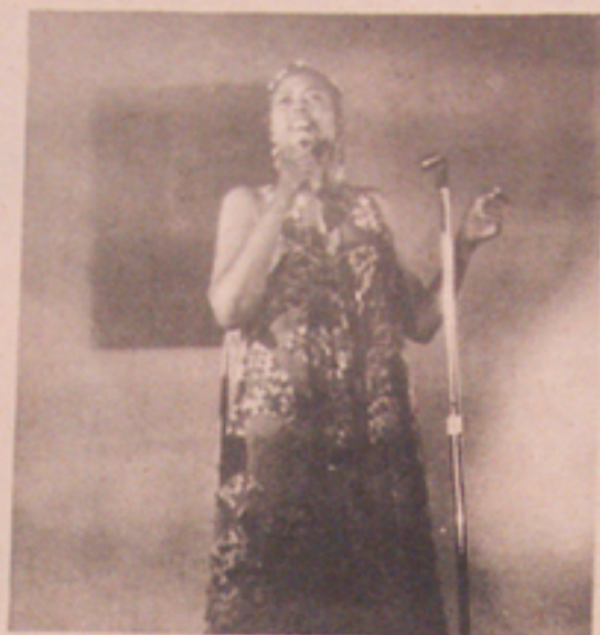
The lovely AMINATA MOSEKA (Abbey Lincoln) impressed last weekend's audiences at the Community Learning Center benefit with her unique, natural singing style.

Barefoot, hair beautifully cornrowed, and clad simply in a long, flowing African-style pants dress, Ms. Moseka impressed her audiences with the genius of her very natural performance. "I is what I is," said Ms. Moseka in a