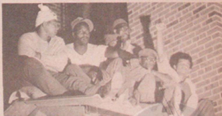
Attica inmates show solidarity during September, 1971, uprising which claimed the lives of 43 prisoners and employees.

In related events, the Attica Brothers won a major victory in late June when an Erie County judge threw out 95 per cent of the jury pool because it was not a fair cross representation of the county's population. Responding to the court decision the ABLD said, "While these rules do not provide