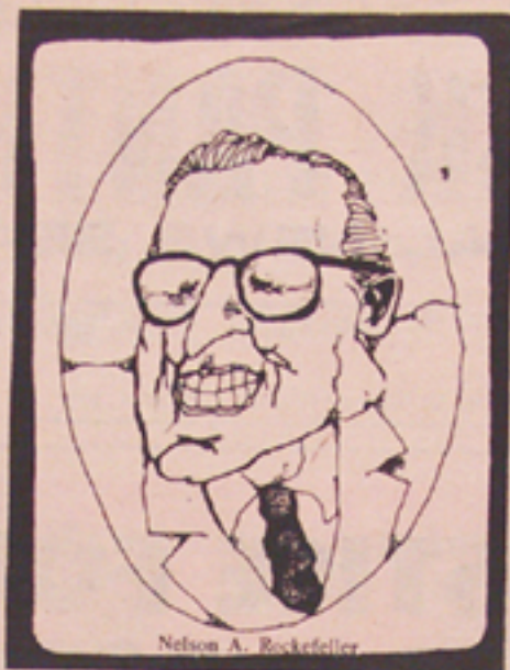
Nelson A. Rockefeller

We must press to eliminate these offices: a first step in preventing our reactionary suicide.