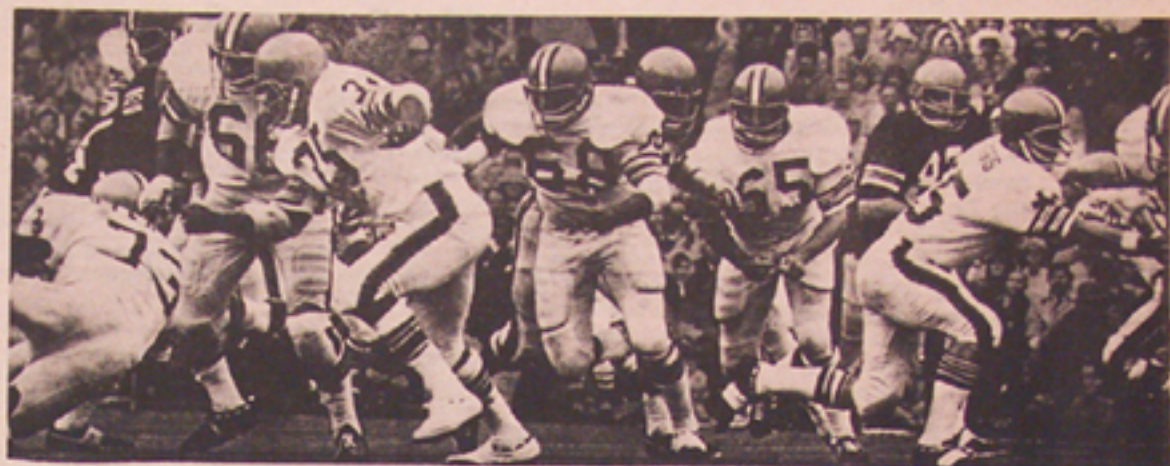
N.F.L. strike characterizes the exploitation and low wages in professional football which has led players to seek control of sport in the context of workers' control over industry generally.

"Pro footballers on strike?!!" the sports editor fumed. "What's the world coming to?" Yet this year with runaway inflation "officially" underestimated at close to 15 per cent, "professional" football players joined garbage men, transit workers, dock loaders, teachers, airline stewardesses and many, many others on the picket lines.