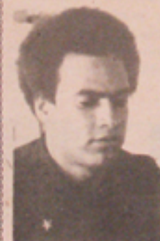
HUEY P. NEWTON