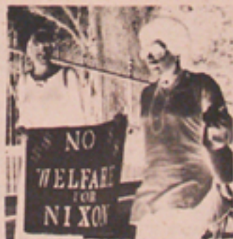
Members of Save The People picket in Washington, D.C.